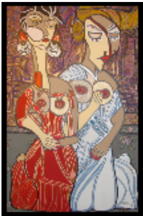
"The Mistress & the Widow"

Lallouz is part of a talented group who are currently forming a coalition for projects including feature films, book publishings, Broadway bound theater productions and art exhibitions. All inquiries can be addressed to: www.GalleriaLallouz.com