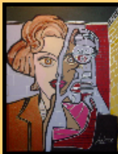
"Portrait of Noëlle Bush"