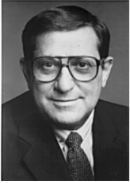
by Ron Levitt Contributing Writer